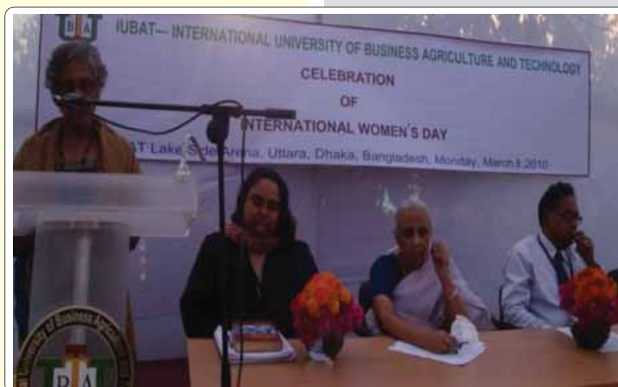
International Women's Day at IUBAT

The 18th CEEMAN Annual Conference in Caserta (Naples), Italy will be held from September 23-25, 2010. Focusing on the topic of "New Global Performance Challenges and Implications for Management Development" and organized in cooperation with Coca-Cola HBC Italia, it will be a prominent international event, with great speakers, productive discussions, and friendly atmosphere, which CEEMAN events are famous for.