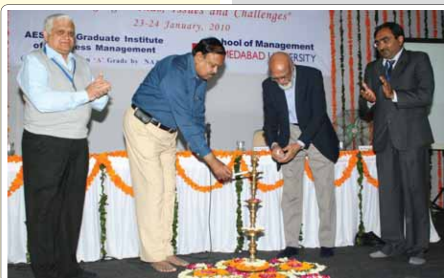
National Conference on Managing for Tomorrow – AES Post Graduate Institute of Management, Ahmedabad, India