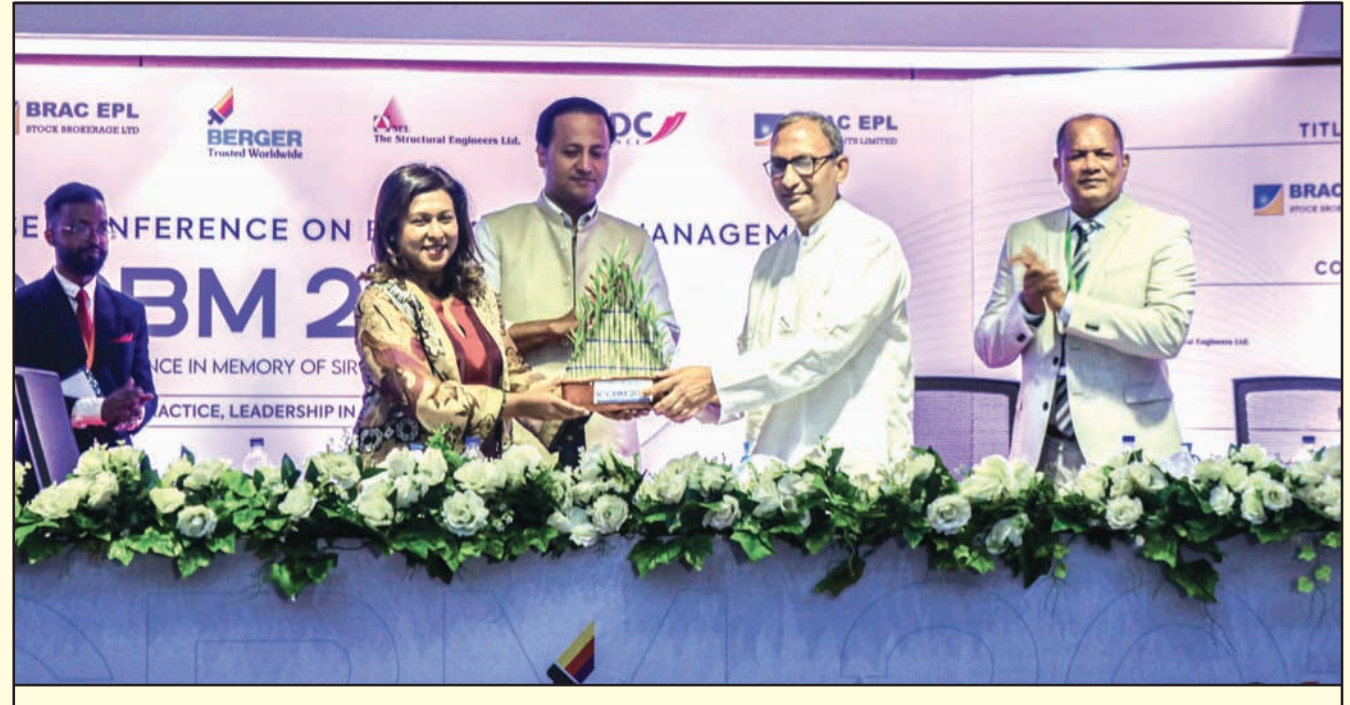
Opening Ceremony of BRAC Business School (BBS) ICCBM 2023

After a rigorous review process, 58 case studies, mostly based on local businesses, were selected for the conference. The conference held concurrent sessions for presentation of selected cases. In addition, a plenary session titled "Excellence in Teaching and Learning: Bridging the Industry-Academia Gap using Case Method of Pedagogy" underscored the central theme of the conference. These sessions provided valuable insights into the best practices for teaching and learning in the business world.