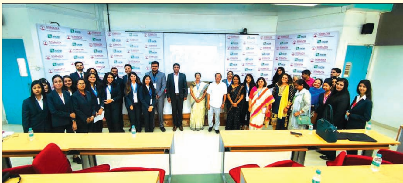
Participants at 3rd International Healthcare Management Conference 2023