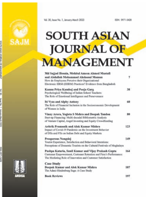
Volume 30 Issue 1

Please visit www.amdisa.org/sajm/ to subscribe and www.sajm-amdisa.org to submit articles online