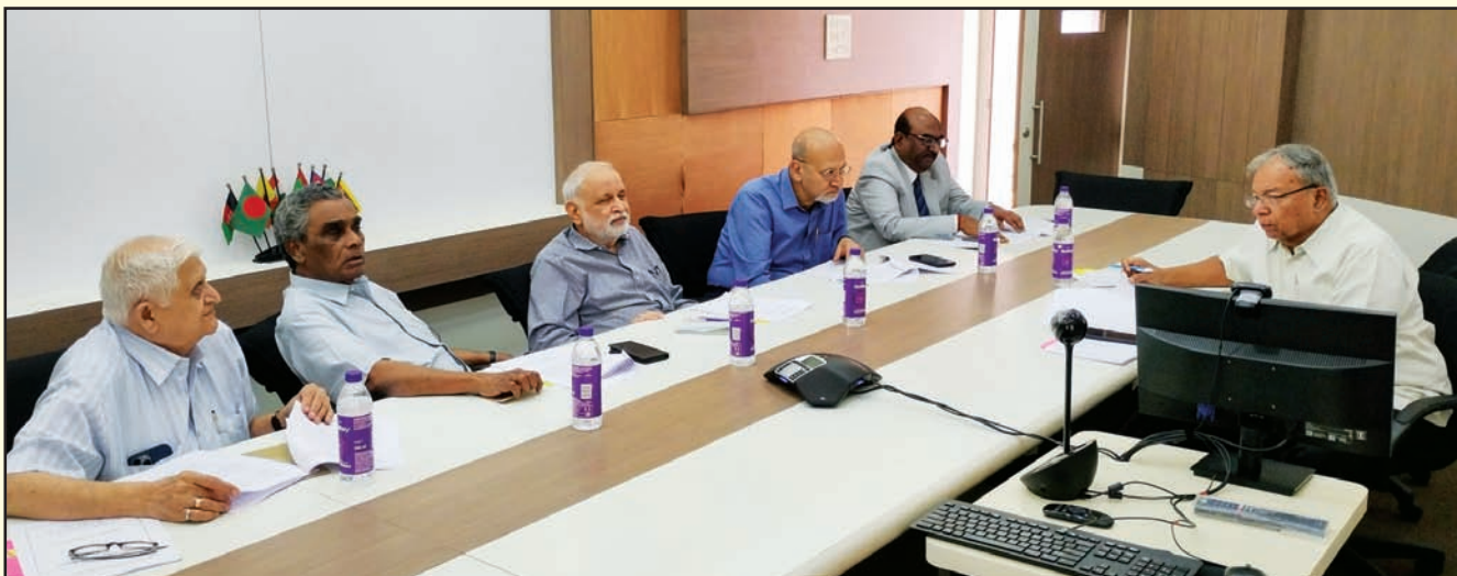
Local Management Committee Meeting