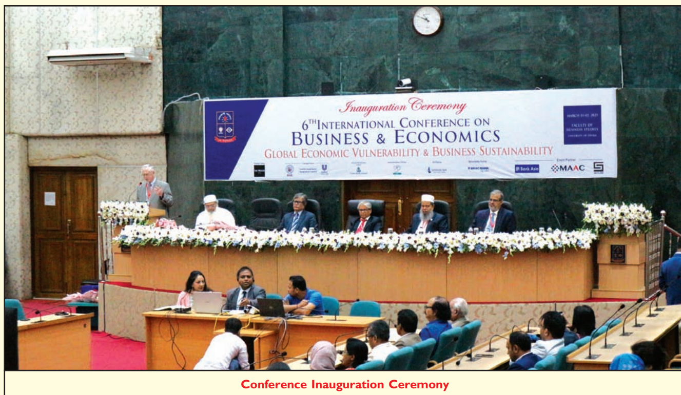
Conference Inauguration Ceremony

The Faculty of Business Studies, University of Dhaka organized the 6th International Conference on Business and Economics on March 01-02, 2023. The Faculty of Business Studies has been organizing this conference regularly for the last six years. This year, the theme of the conference was Global Economic Vulnerability and Business Sustainability. The objective of the conference was to bring together academics and professionals to a common forum for developing strategies to meet global business challenges in the years to come. In addition, the conference created an opportunity to share experiences, exchange new ideas, foster innovation, and establish research relations among the participating individuals and institutions.