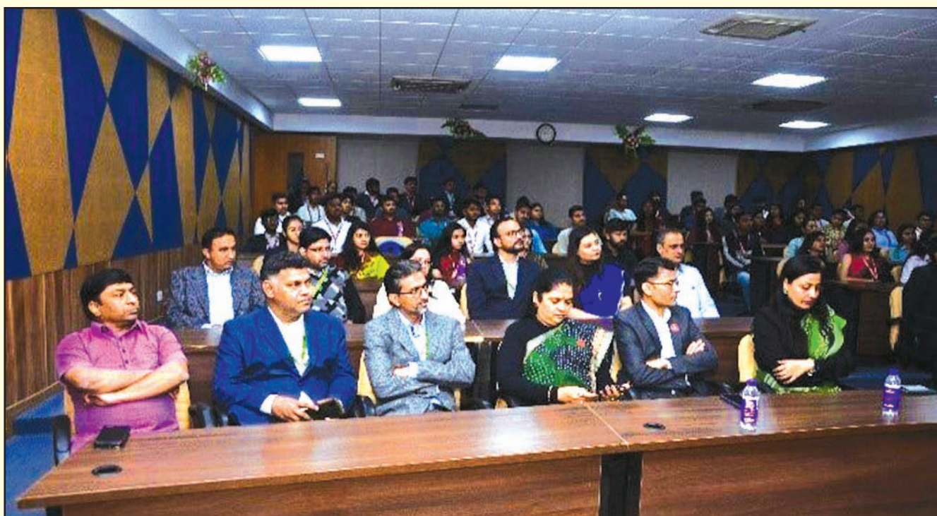
Participants at the 15 th International Conference

Ganpat University - Faculty of Management Studies organized the 15th International Conference on Emerging Management Practices on Economic Growth Drivers for Industry 5.0 on 11th and 12th February, 2023, in association with Ganpat University - Centre for Advance Research Studies and AMDISA (Association of Management Development Institutions in South Asia). The international conference for Emerging Management Perspective (GCeMP) was designed to deliberate the predominant issues and provides an excellent opportunity to the Researchers and Academicians, Professionals, Policy Makers, Organizations and Boards to present their research, cases, concepts and practices on the theme of the year. This year conference was conducted in the theme Economic Growth Drivers for Industry 5.0. Analytics & Automation, Innovation, Manufacturing & Logistics and Social Inclusion.