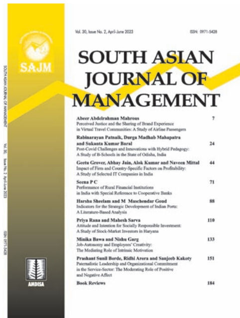
Volume 30 Issue 2