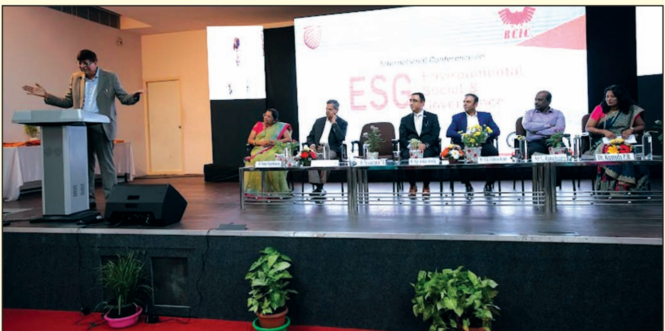
International Conference on ESG - Inauguration