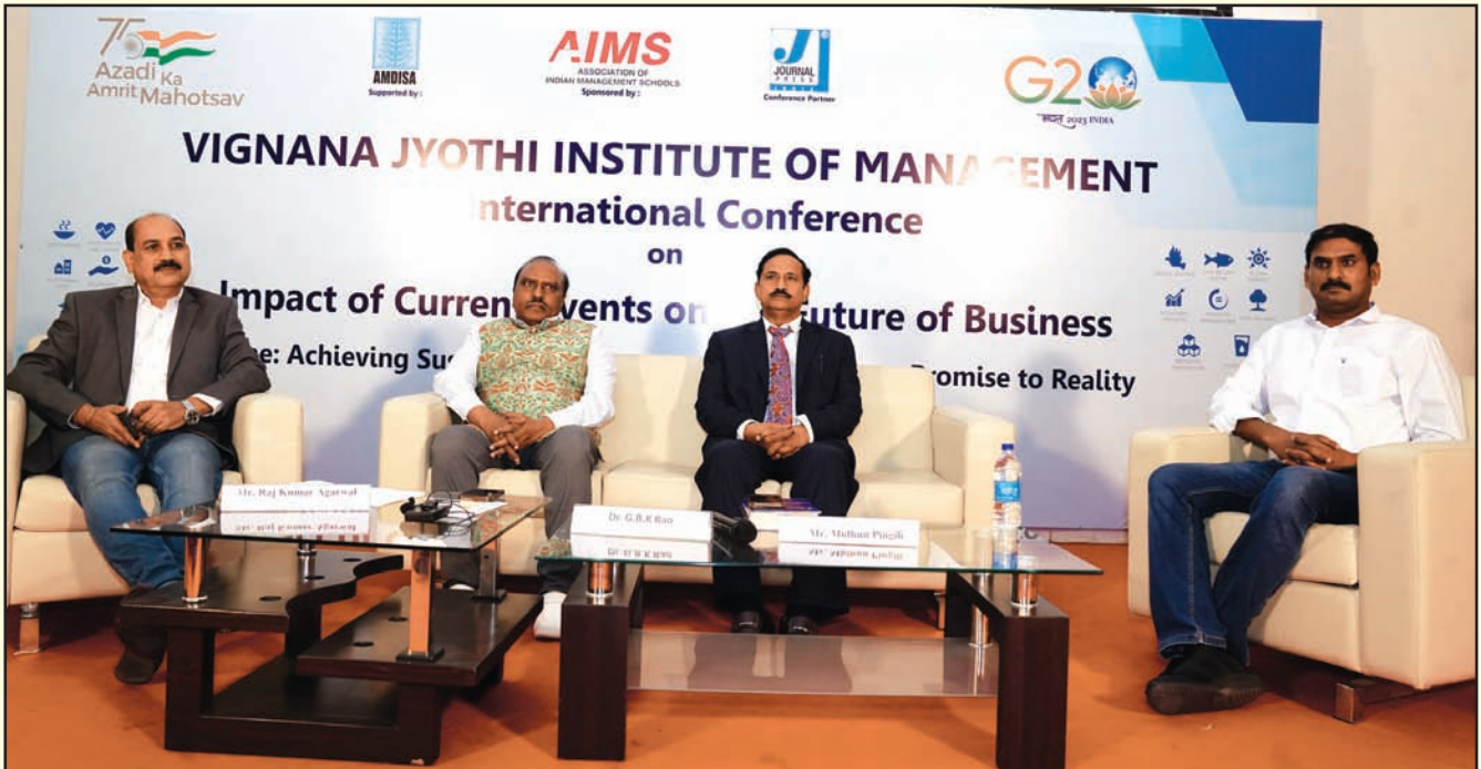
Leaders's conclave: 'Harnessing Business to Achieve the Sustainable Development Goals'