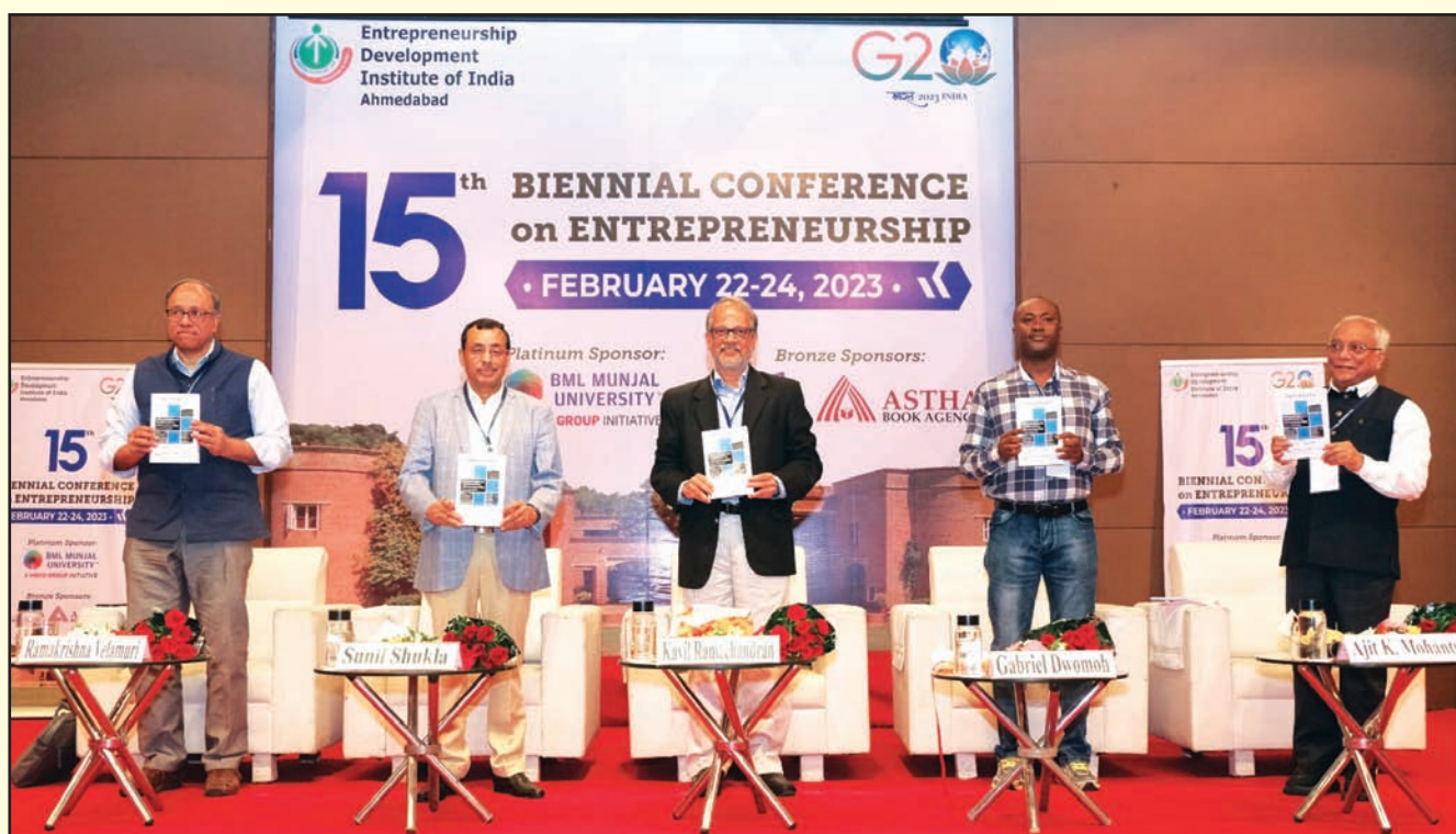
Releasing Abstracts' compilation of the papers selected for presentation at the 15th Biennial Conference

As part of the conference, a Vice Chancellors'/Directors' Conclave was also held to discuss the Importance of Entrepreneurship Education in the Context of the National Education Policy (NEP) 2020. Universities from across the country were represented.