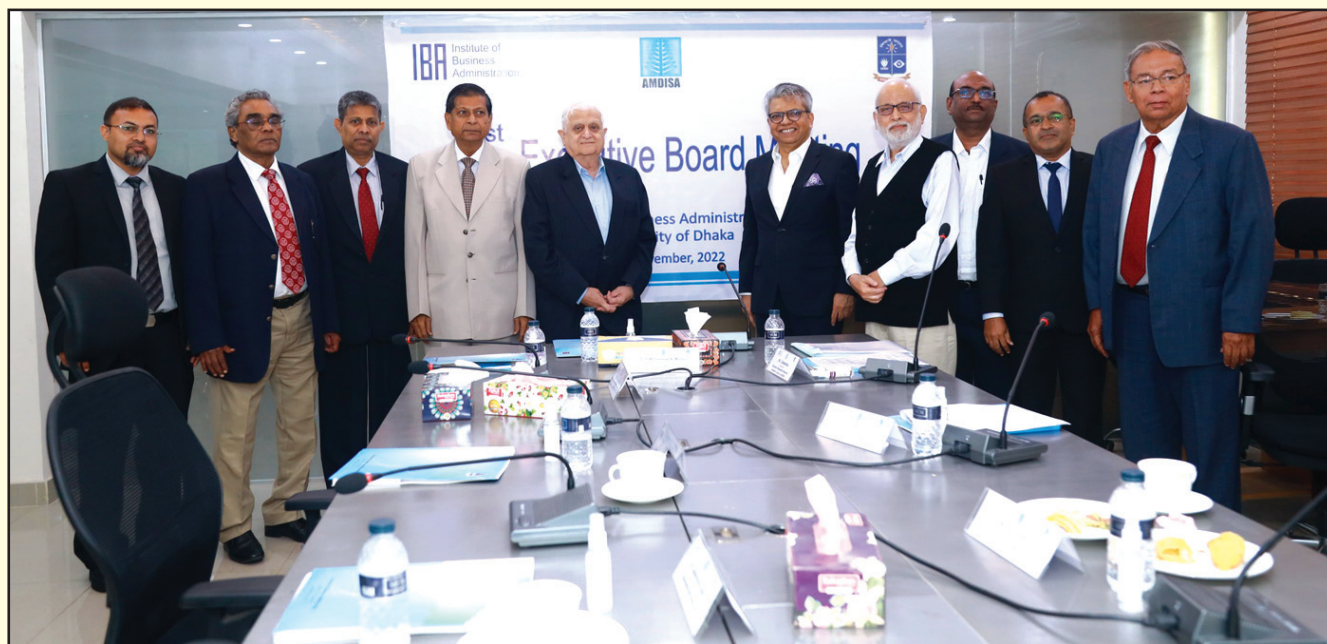
Executive Board Meeting at IBA, Dhaka, Bangladesh