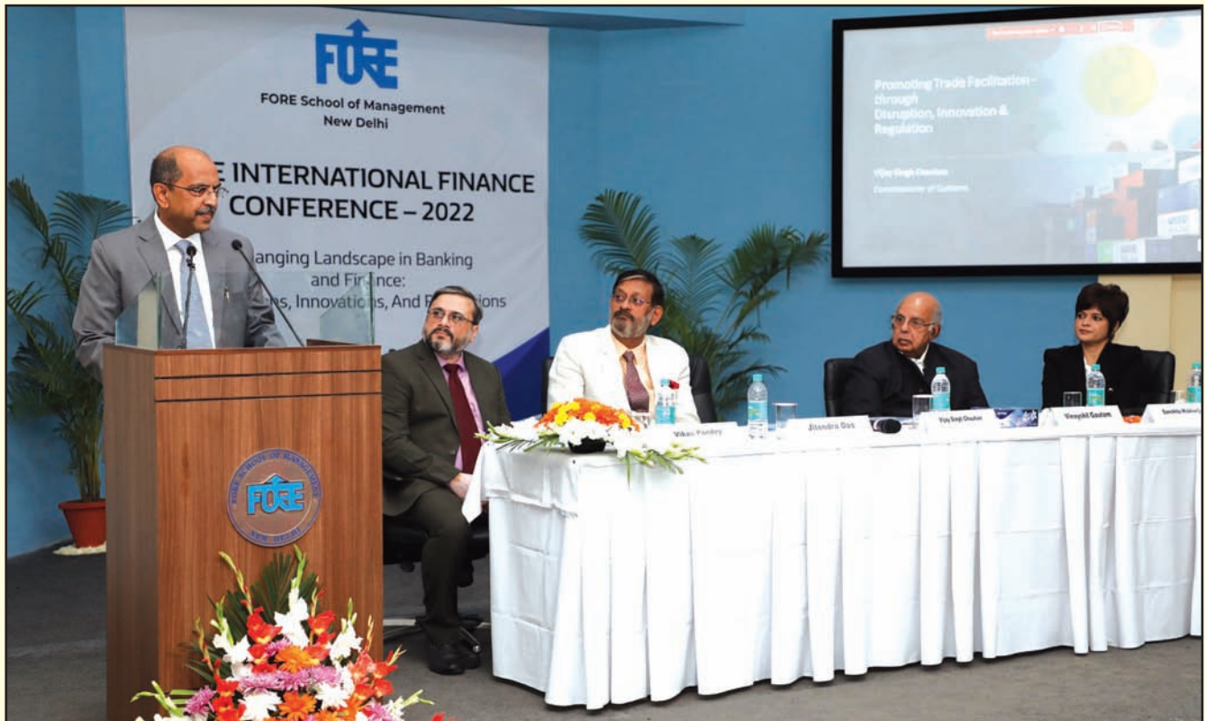
Address by Guests at the Conference