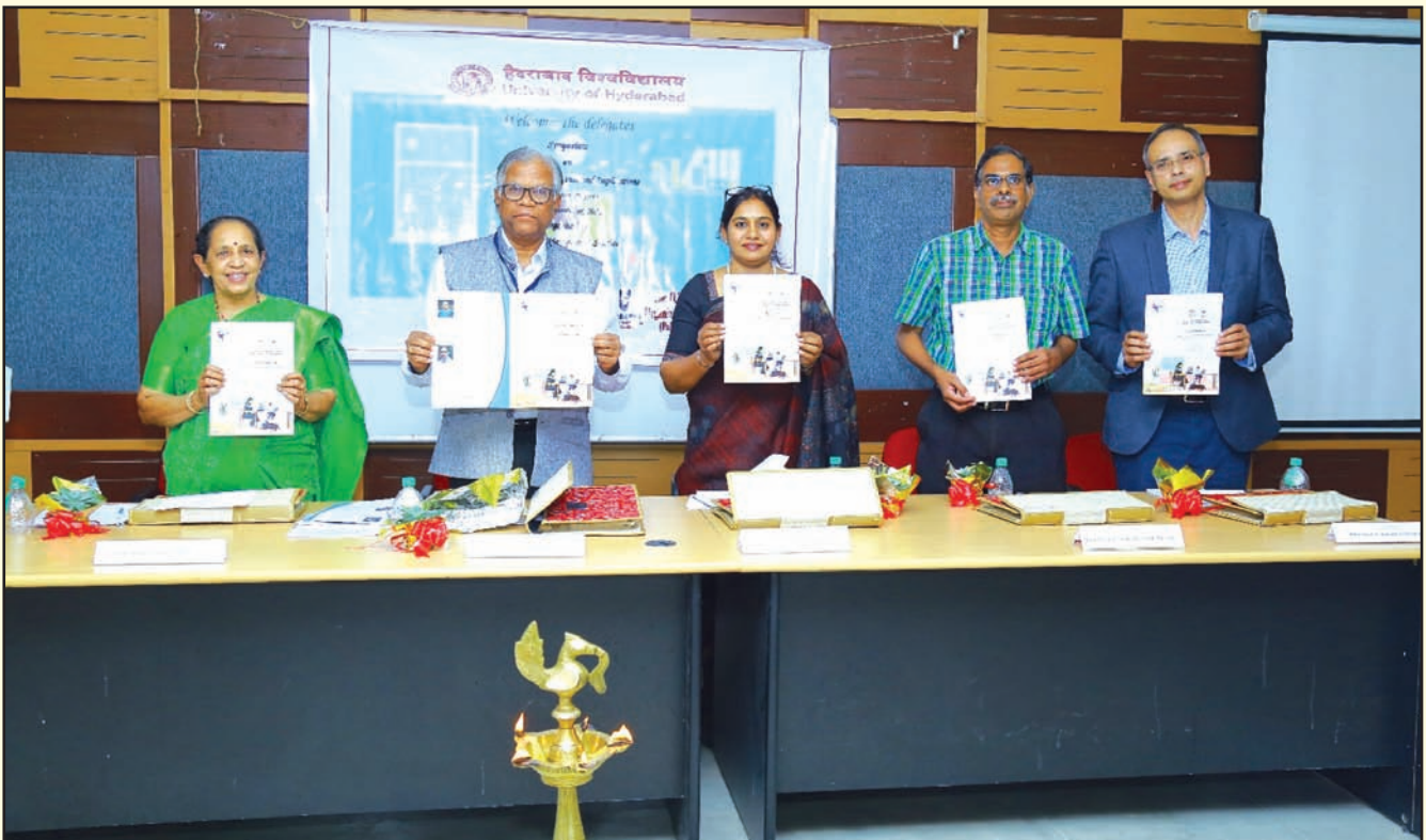
Symposium on Work from Home organised by School of Management Studies, University of Hyderabad, Hyderabad, India