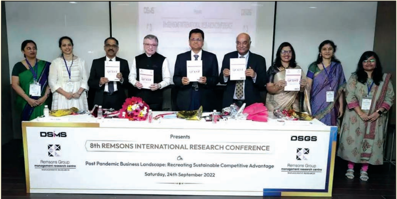
8 th Remsons International Research Conference organised by DSIMS, Mumbai, India