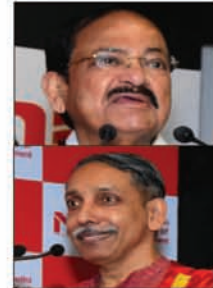
Chief Guests at NDM Conventions

Declared by AICTE, Govt. Of India, and the Confederation of Indian Industry Declared Best 5 years in a row by ASSOCHAM in North India/ Placements in India Declared Number 1 in India for 'Excellence in Employability through Industry Engagement' by FICCI