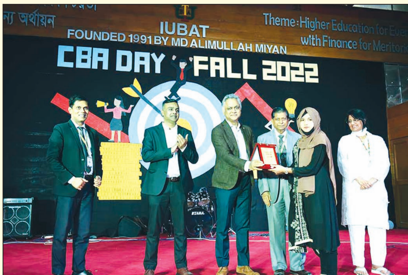
CBA Day Fall 2022 at IUBAT, Dhaka, Bangladesh