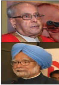
Chief Guests at NDM Conventions

Only B-school where "Incubation Centre" for promoting 'Entrepreneurship & Innovation' has been established by a premier Industry Chamber "ASSOCHAM" | India International Skill Centre" of NSDC, Govt of India | India Centre of QS ranked Asian Institute of Technology, Thailand (International university since 1959) for DBA Programs | Only Partner of Australian Risk Policy Institute in this part of the world | Faculty drawn from 33 International Universities who worked with 310 corporate houses | 133 recruiters & top academia guide & lead the curriculum and academics | Only B-school in North & Central India continuously chosen for 4 years by the AICTE for Smart India Hackathons, the biggest Digital & Entrepreneurial revolution of Government of India for 25000 startups | Only B-school listed in the "New Education Policy" of the Government of India along with IIM-A