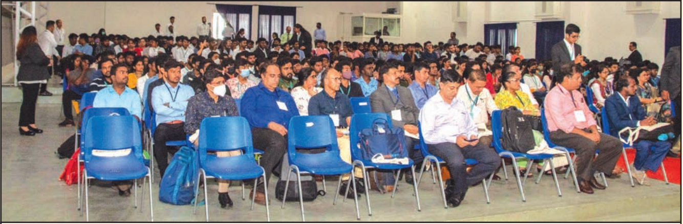
Participants in the Conference