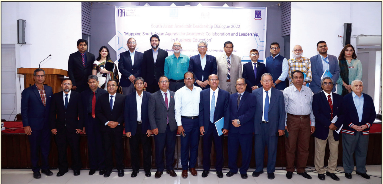
Group Photo of participants in the South Asian Academic Leadership Dialogue 2022 at IBA, Dhaka, Bangladesh