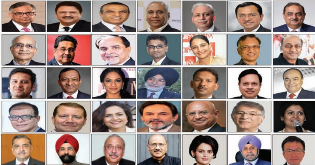
Recent Sessions at NDM by Renowned Industry Stalwarts

100% Finest Placements and Internships for the last 5 years, even during the Covid years