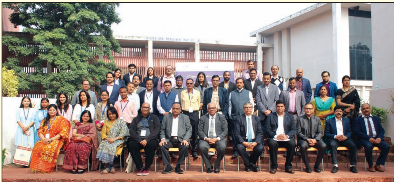
Group Photo of Delegates at the Conference