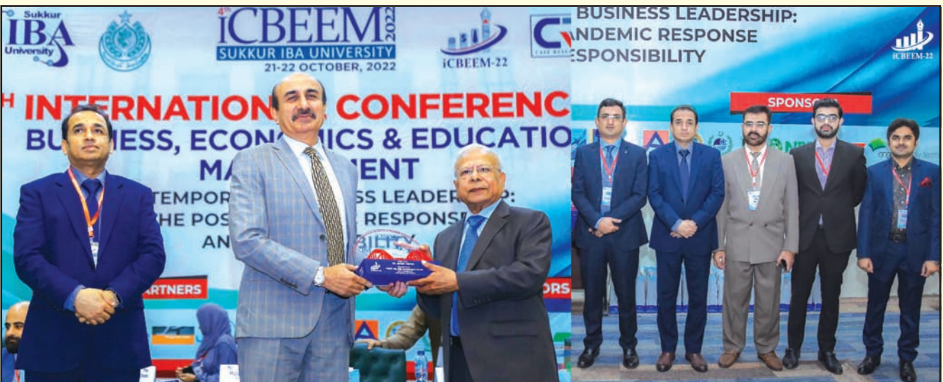
Photos of the Conference

Case Research Center (CRC), Sukkur IBA University organized 4th International Conference on Business, Economics, and Education management. The theme of the moot was ‘Contemporary Business Leadership: The Post Pandemic Responsibility’. iCBEEM-22, aimed to provide a premier interdisciplinary platform for researchers, practitioners, academicians and students to share, discuss and disseminate their intellectual output and research implications to supplement the contemporary post-pandemic business practices in the fields of social and management sciences. The