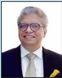
Prof. Mohammad Abdul Momen