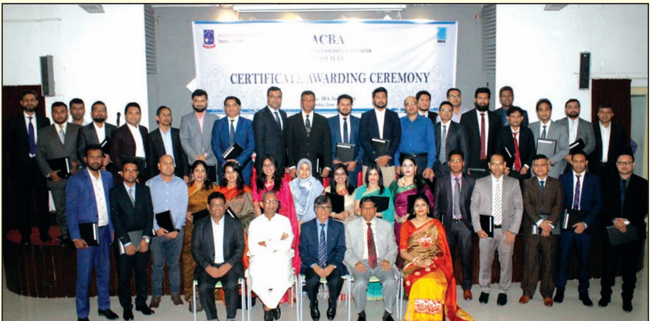
Participants of ACBA Batch-13 with the Guests