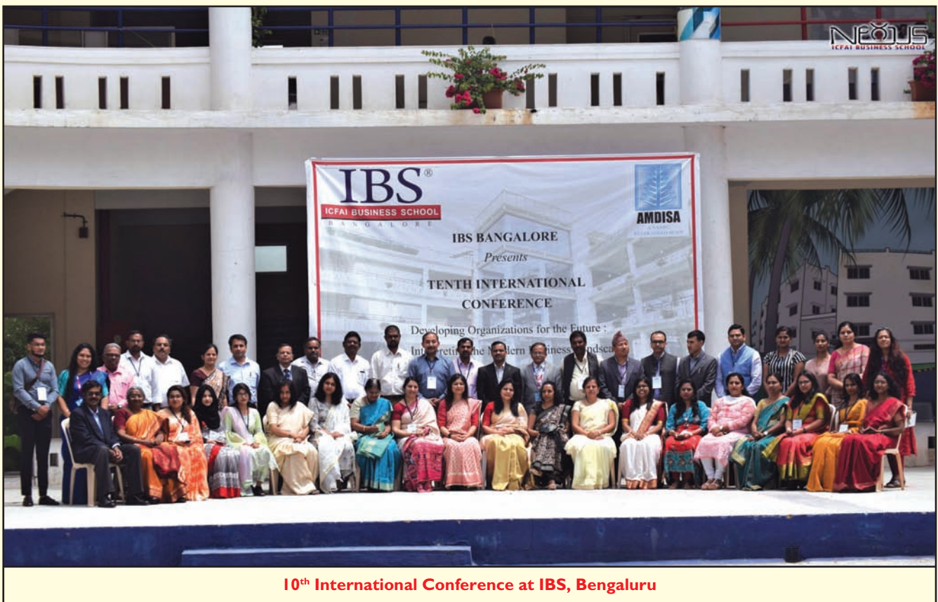
10 th International Conference at IBS, Bengaluru

ICFAI Business School organised its 10th International Conference on 27 th and 28 th June, 2019. The theme of the Conference was “Developing Organizations for the future – Re-interpreting the Modern Business Landscape”. The conference had the following broad streams – Economics, Finance, Marketing, HR, IT, Analytics and other Management Disciplines.