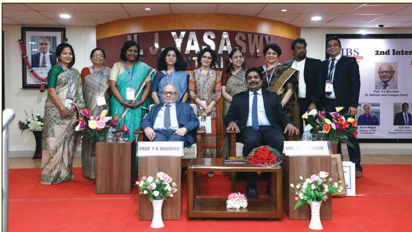
2 nd International HR Conference at IBS, Mumbai