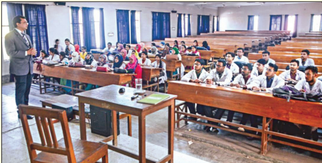
An ongoing class at the Khulna Medical College.

At a time when the learner-centric rhetoric is rife with terminology such as critical thinking, flipped classrooms, group discussions, problem-solving, simulations, role playing, case analyses, research, and much more, I ask whether these tools can be used in the type of classroom depicted in the picture? Unfortunately, this situation prevails across the nation—classroom after classroom with rows of benches, tight spaces, and little room for meaningful student interaction. Can any learning really occur in this environment?