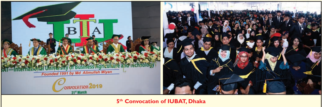
5 th Convocation of IUBAT, Dhaka