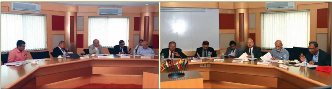
75 th AMDISA Executive Board Meeting in Session