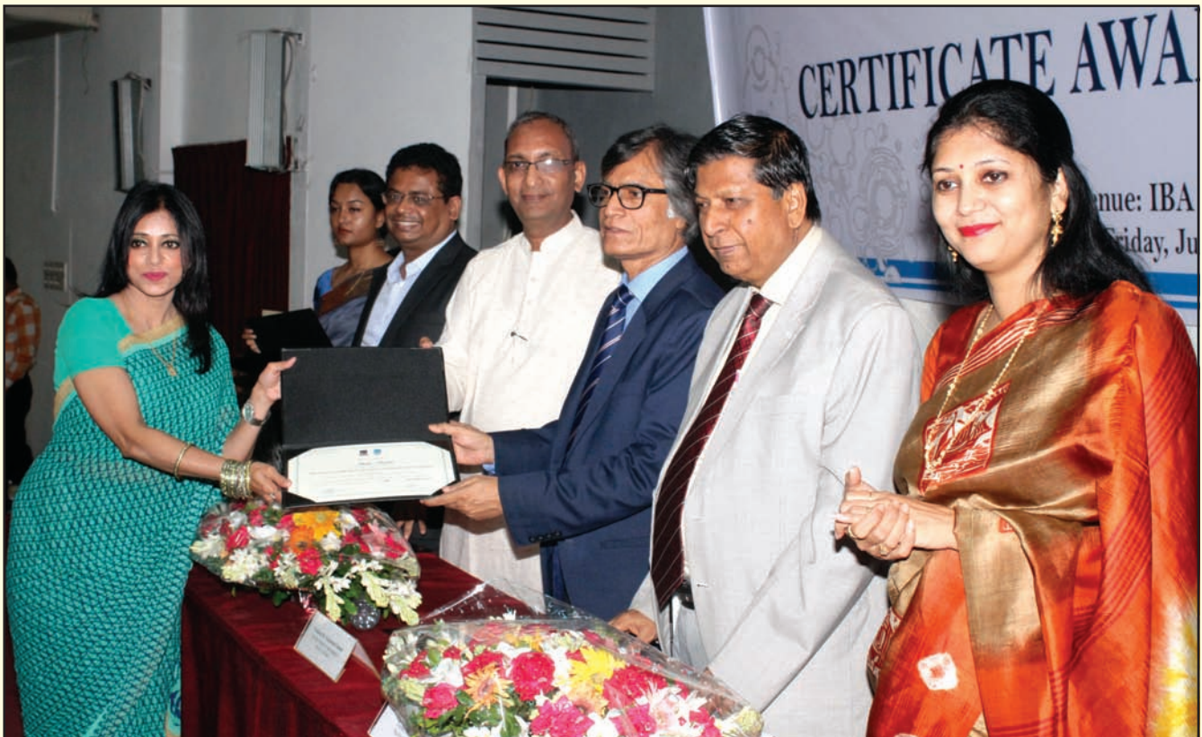
ACBA Certificate Awarding Ceremony