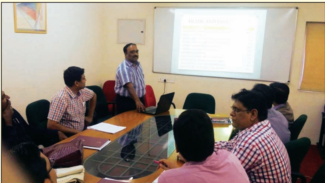
EDI Faculty, Staff & Students celebrating SAARC Charter Day at EDI campus

SAARC Charter Day was celebrated at Entrepreneurship Development Institute of India (EDI) on December 8, 2015 with an aim to raise awareness among people about SAARC and its important activities and thereby, to enhance South Asian identity and solidarity within the region and beyond.