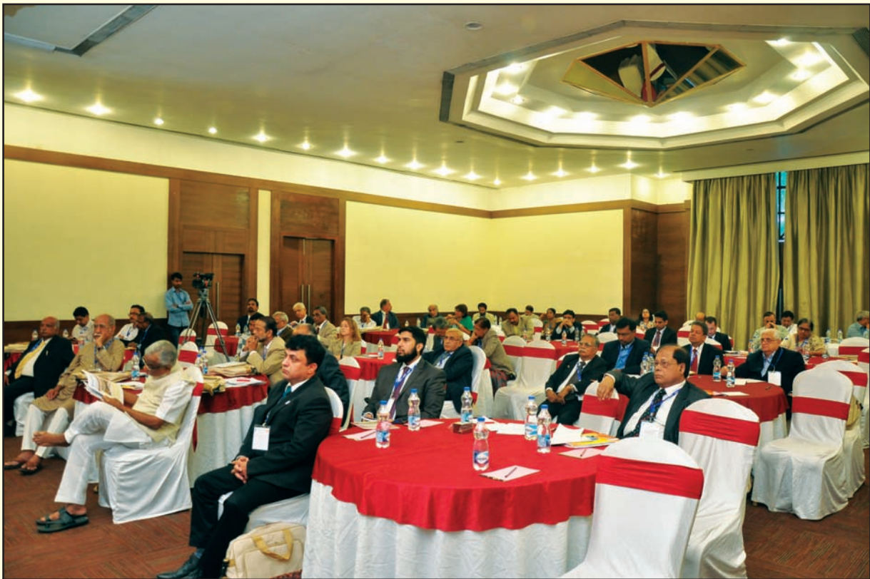
Delegates at the Conference Proceedings of the Conference on “Accreditation for Institutional Learning and Growth” held on 8 th December 2015 at Hyderabad, India.