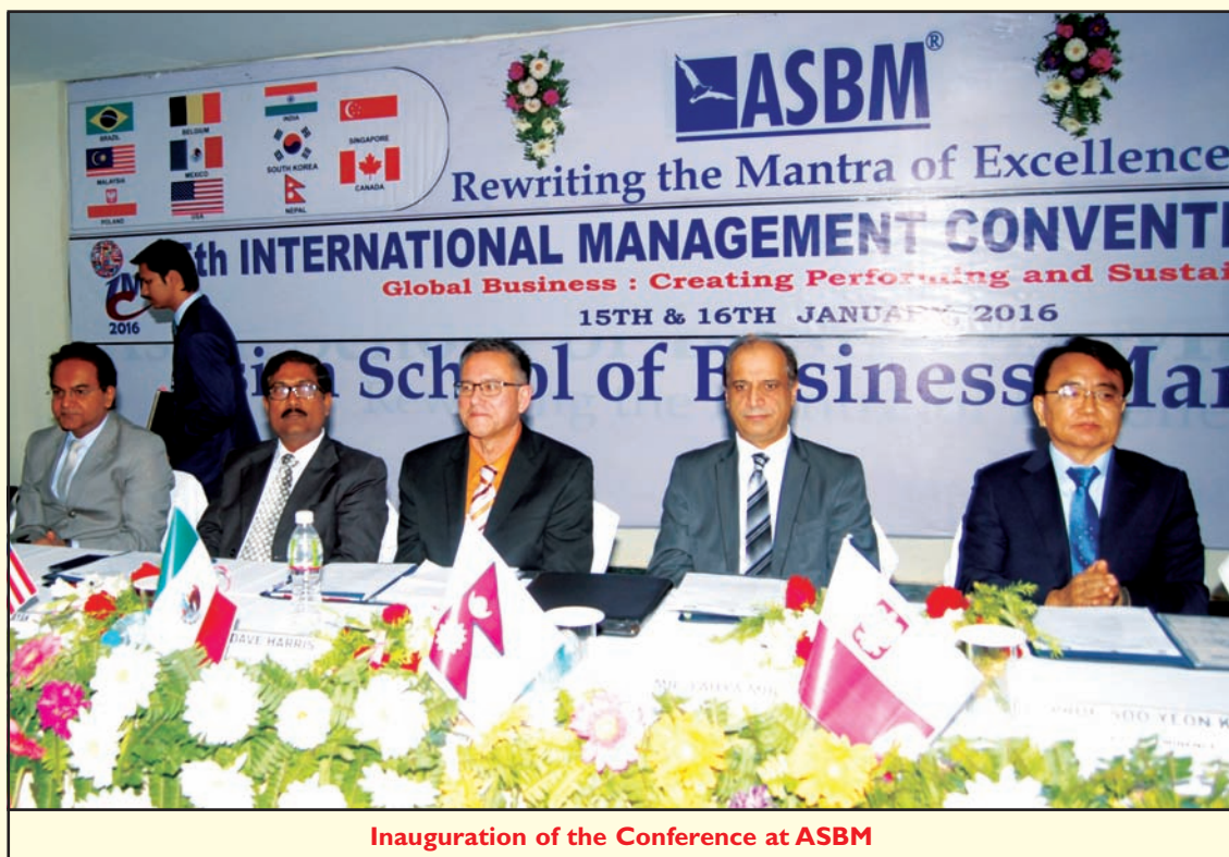
Inauguration of the Conference at ASBM