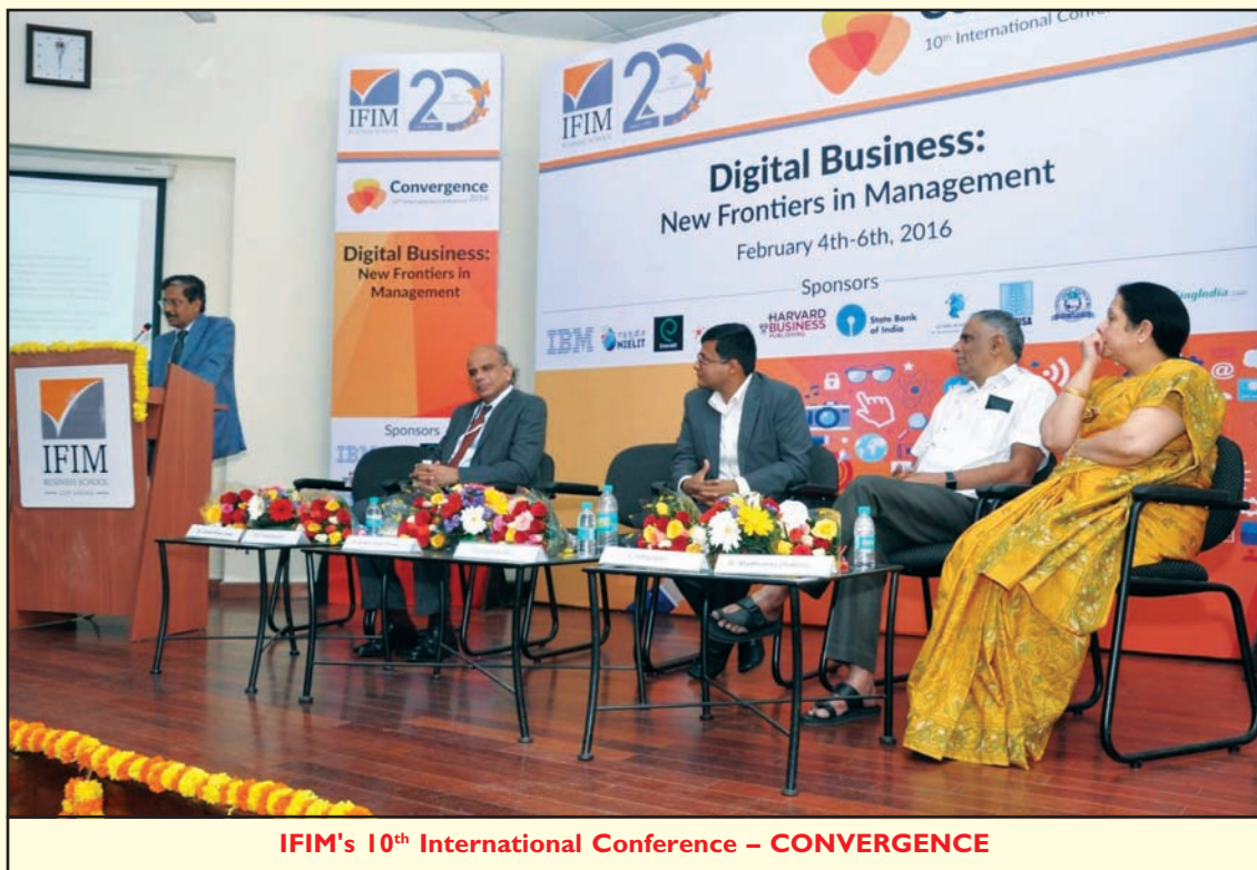
IFIM's 10 th International Conference – CONVERGENCE

This year’s international conference at IFIM brought leaders in industry, government and academia together to address the latest business opportunities, breakthroughs in technology, trends in digital business & education, future of brick-and-mortar stores and innovations likely to emerge in near future. From our elite speakers, to the record number of participants, Convergence 2016 was a resounding success and created a new milestone in the history of IFIM Institutions. The event provided thought leaders, practitioners and researchers with the golden opportunity to share their experiences and ideas with the right set of audience.