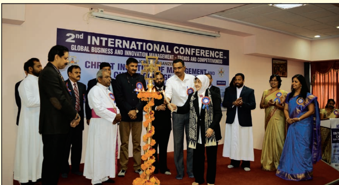
Inauguration of the Conference at Christ Institute