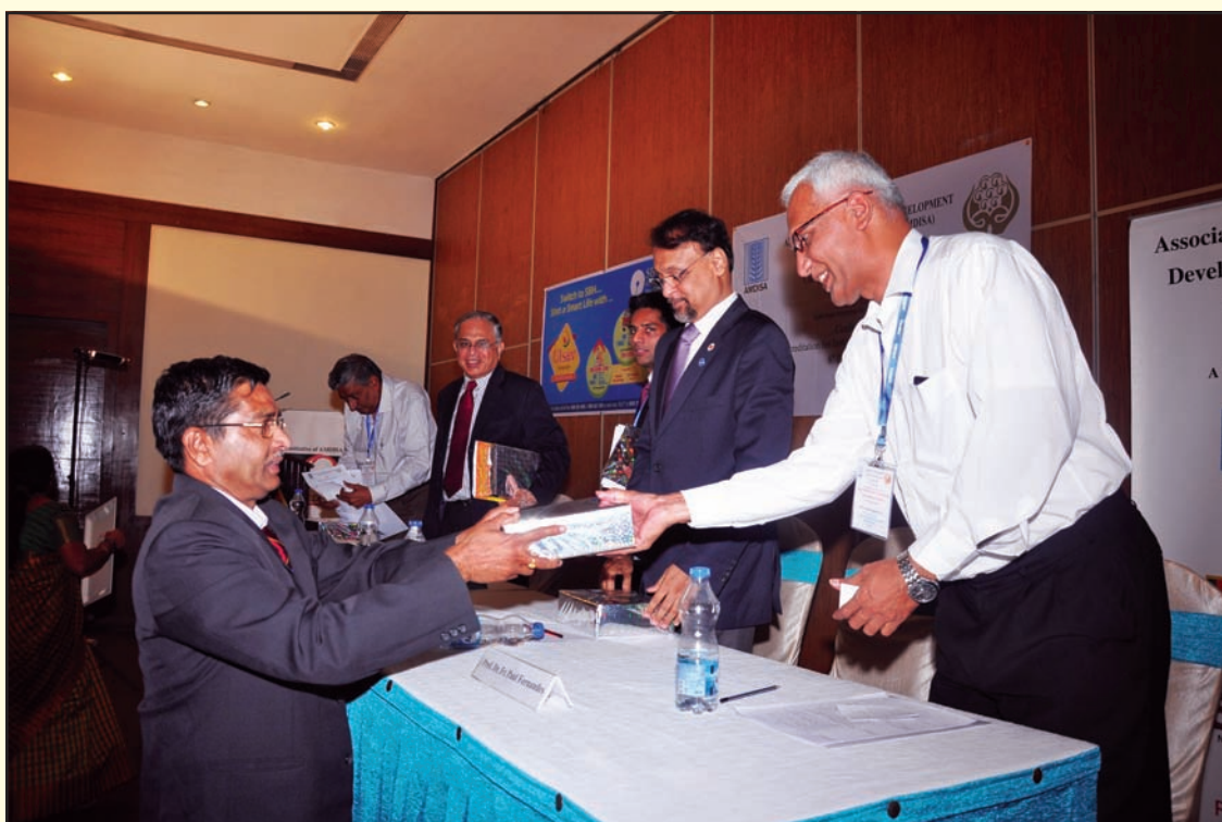
Mementos presentation to the Panelists